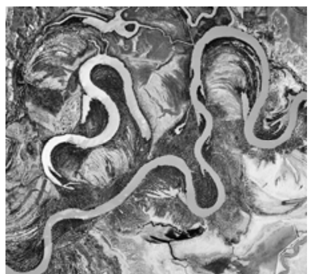
Rivers are dynamic systems that change over time

The factors controlling river and stream formation are complex and interrelated. These factors include the amount and rate of supply of water and sediment into stream systems, catchment geology, and the type and extent of vegetation in the catchment. As these factors change over time, river systems respond by altering their shape, form and/or location. In stable streams the rate of these changes is generally slow and imperceptible.