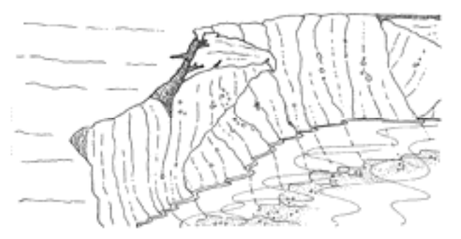
Undercutting of the bank toe is a sign of bank scour

Bank scour is the direct removal of bank materials by the physical action of flowing water and the sediment that it carries.