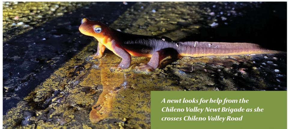
A newt looks for help from the Chileno Valley Newt Brigade as she crosses Chileno Valley Road

of ecological restoration in action — a place where lush riparian corridors and pollinator hedgerows coexist beautifully with a direct-to-consumer beef business and a U-Pick apple and pear orchard.